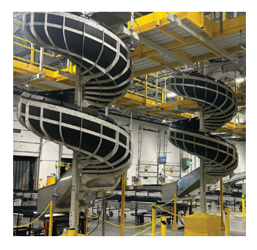
Material Handling Chutes

Platform consultation, design engineering, fabrication and delivery.